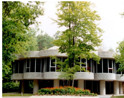
Northwood University in Midland, MI

Sunday, June 17 th to Saturday, June 23 th , 2012