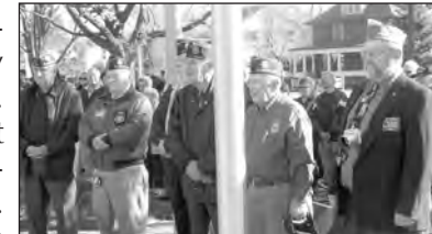
Local veterans honoring their fallen comrades at the Plymouth Veterans Day ceremony

If anyone is looking for a good venue next year to commemorate the veterans, I would recommend they consider the Veterans