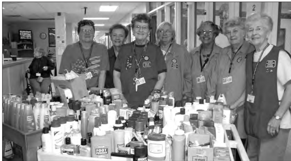
Members of the Fifth District helping to take the service carts on the floors.

We also donated 50 bags of toiletries to three shelters, plus 50 different articles to a Children's Hospital in Africa. The Auxiliary is devoted to helping veterans and children, and that is what we continue to do.