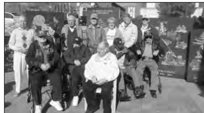
Veterans from World War II

I had the honor of attending my first Veterans Day ceremony as Secretary-Treasurer at the Plymouth Veterans Memorial Park. I was told that they had a nice memorial park. My, I was truly impressed. The marble sandblasted memorials were absolutely beautiful. The landscaping was lovely and the atmosphere with the crowd was solemn and respectful.