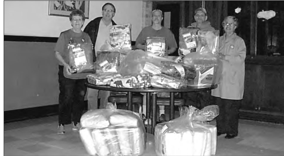
Preparing to deliver blankets to the homeless veterans at one of the shelters.