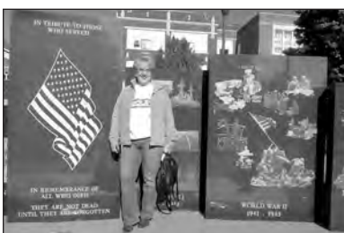
Standing in front of the flag memorial, and displaying some of the other war memorials.