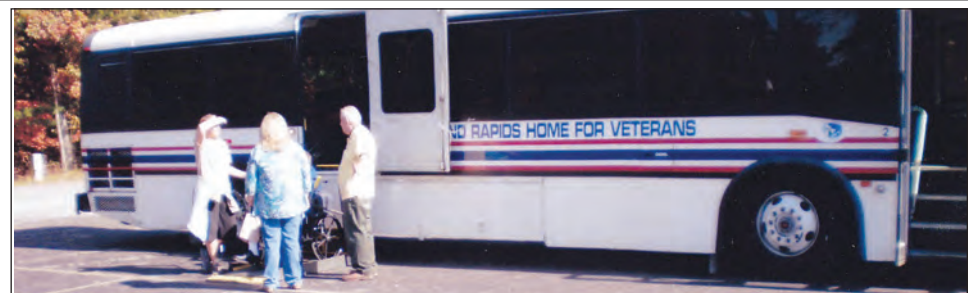
Croton Post 381 hosted 26 men and women from the Grand Rapids Home for Veterans for a “color tour” last fall. Upon arrival, many volunteers served breakfast before the tour.