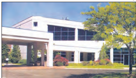
Winter Meeting & National Commander's Banquet - See Page 7