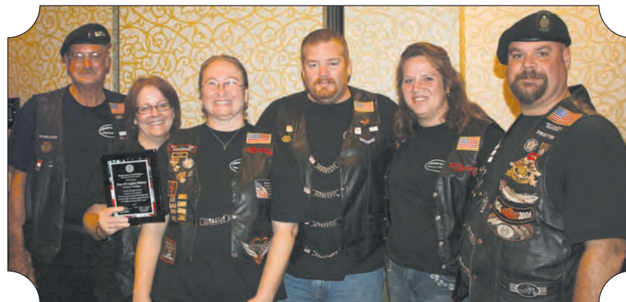
Members of Charlotte Post 42 Legion Riders received state headquarters recognition from State Commander William Hafeman during the recent Fall Conference in Troy. The group collected over $13,000 in Legacy Scholarship donations and delivered the proceeds to national headquarters in Indianapolis. See related story and article-pg. 1.