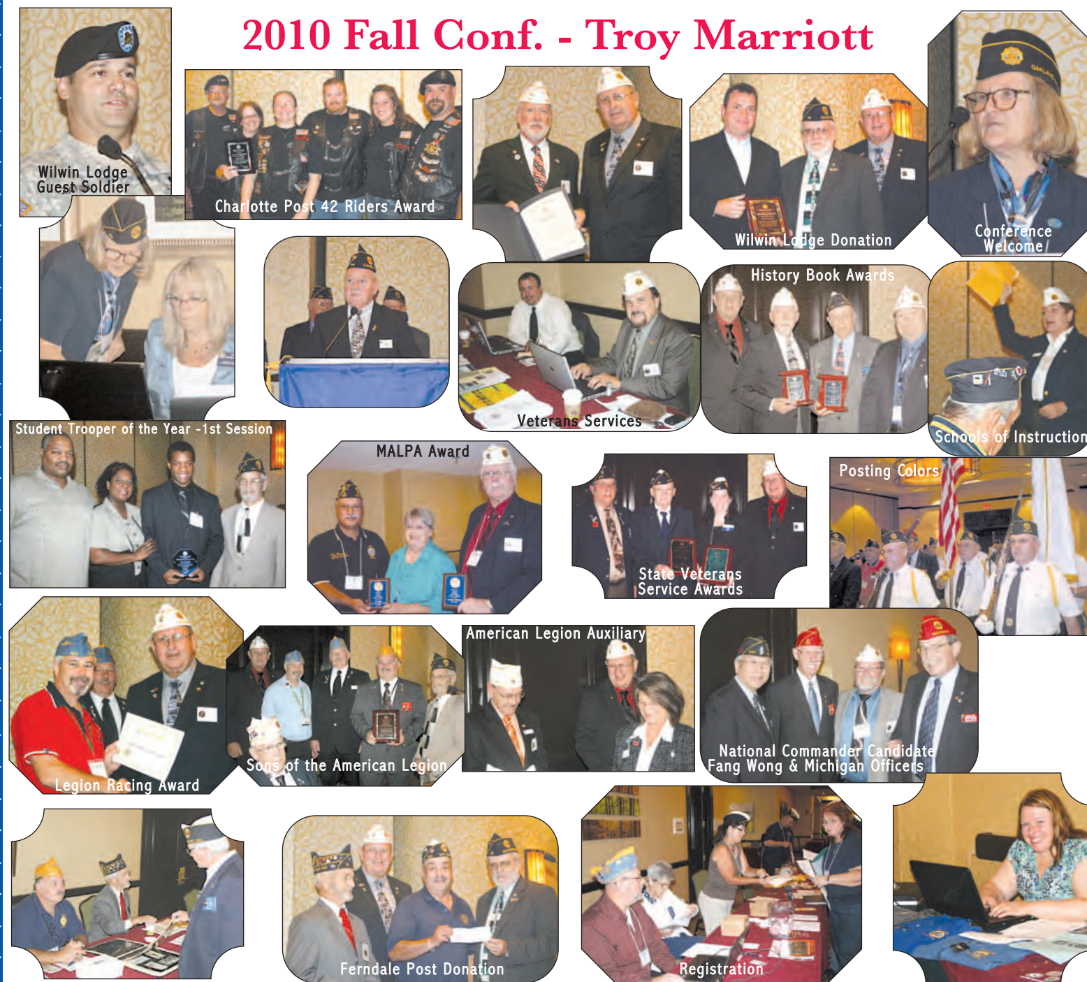
Wilwin Lodge Guest Soldier