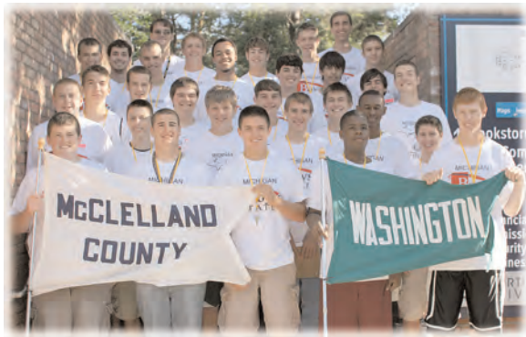
The boys are divided into cities and counties.