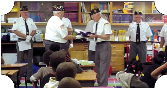
The Legion Family of Post 158 has entered schools teaching the kids in their community about the US Flag. Legionnaires and Auxiliaries members participate in the program. Picture Legionnaires finish showing how to properly fold a flag.