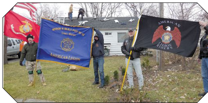
When a Korean War era veteran needed help putting on a new roof The Whole Legion Family from Post 32, during a cold, windy day, sprung into action and got it done in a few hours. His neighbor who works at Post 32 and is a veteran saw his need and called in reinforcements. "Every day is Veterans Day"