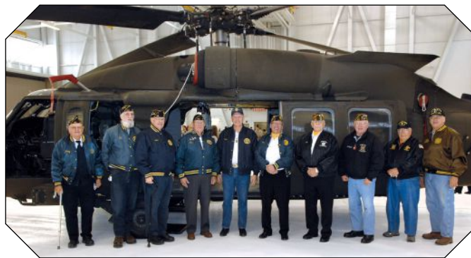
American Legion and Veterans of Foreign Wars members participated in the departure ceremony, of MI Army NG Soldiers from the Grand Ledge Army Aviation Support Facility deploying to Kuwait after training in Fort Hood, Texas.