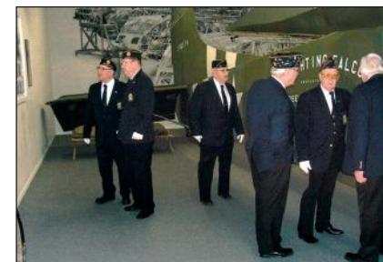
Members of Post 101 honor guard visited the Greenville Glider and Military Museum. The main feature of the museum is a CG-4A Glider.