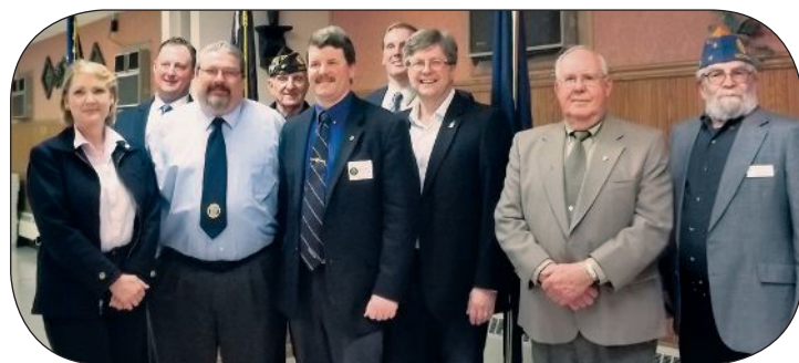
A great time was had at the UP Associations Legislative Reception in April. Thank you Post 50 for a great dinner and time.

Lynn C. Weeman Post 514, The American Legion held its 56th Birthday Party and celebrated the 95th Anniversary of the American Legion on March 15, 2014. Guest were (left to right) PNC