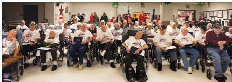
The Upper Peninsula Honor Flight held an "Honorary" Honor Flight for over 70 World War II veterans at the D. J. Jacobetti Home for Veterans in Marquette. The program consisted of videos of the UP Honor Flights first mission in September 2011 and patriotic music from a USO style show in Escanaba which benefitted the Honor Flight.